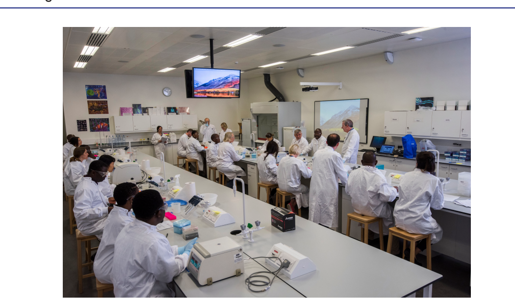
FIGURE 4. Molecular Bacterial Load Assay (MBLA) Stakeholders Conference Delegates Participating in an MBLA Training Session